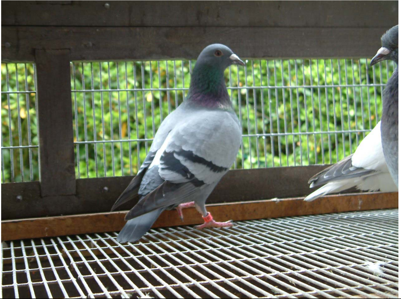
The picture above shows a young blue cock from the race team, which has been managed under controlled light conditions (similar to traditional "Darkness") the red in the picture below is moulting under natural conditions and the close up blue is another controlled light pigeon. Photos taken end of August 09

When fed youngsters require energy and moisture from the body during the digestion process. If the content of their diet is too heavy, it can weaken the pigeon and provide an opportunity for the wrong intestinal bacteria to prosper and rapidly take over. Once this happens then it is almost certain that disaster will follow. The diet content should be as light as possible with a fat content of around 7% to 8% which is good for racing up to about 200 miles. Beyond this distance it is necessary to increase the maize and fat content with appropriate seeds. The conversion of fat to energy makes moisture available to the pigeon's body. A mixture with a higher in fat content ensures that the pigeons will arrive home less thirsty at the end of the race. Feed at the start of the week needs to be a little less and at the end of the week give them more. The day before basketing is most important and they should get all they want. Pigeons that eat a lot on shipping day, as a general rule, are not the first in the clock on race day. When they only spend one night in the basket their crops should be empty, when they are spending two planned nights in the baskets, then they can have some feed in their crops up to a maximum of half full.