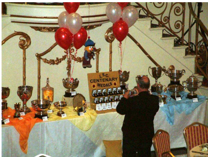
Centenary year trophies and medals on display.

Lancashire Social Circle: The end of October is a time that I look forward to it is followed by the Autumn gathering and prize dinner of the LSC. Which, takes place on the first weekend of November. It is a most enjoyable weekend, when members and their guests, many of whom are distinguished names within the pigeon sport, get together and share friendship and hospitality. The prize distribution evening dinner is usually attended by around 120 members and guests, all of whom are male and support the strict code of tradition which is the infrastructure on which this great club is founded.