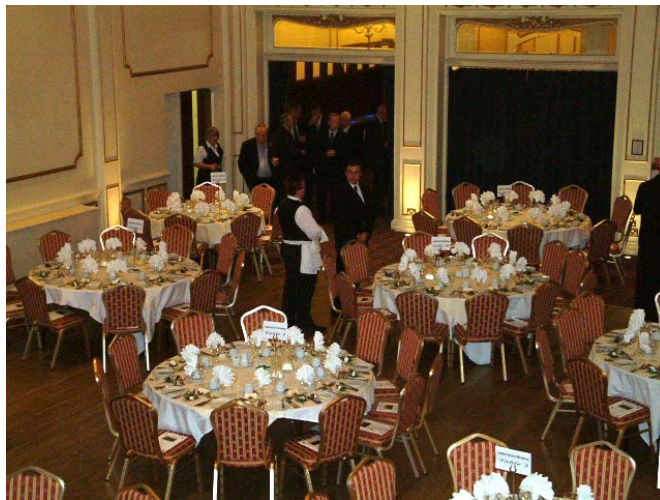
Tables await the members and their guests.