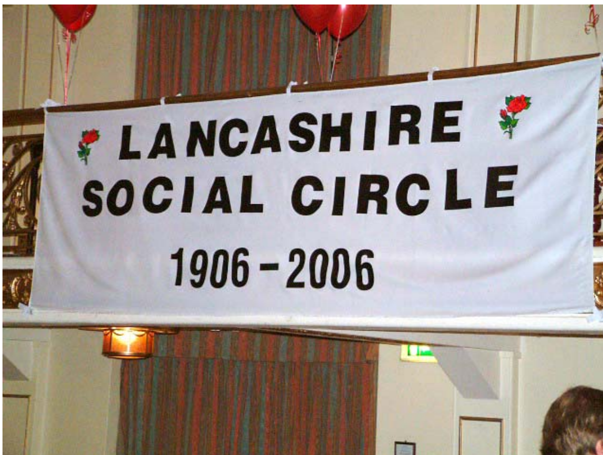
The banner proudly shows the 100 years of red rose friendship as celebrated in centenary year!