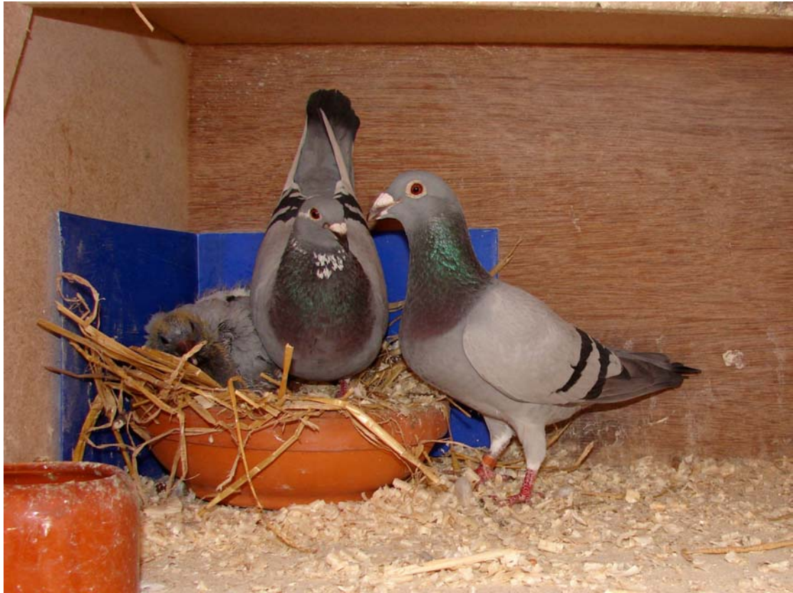
Jock King's 1 st section C 6 th open cock with his hen after the race