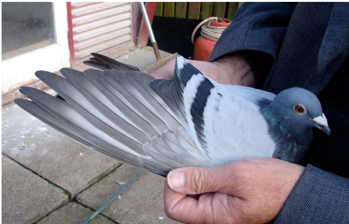
The wing of Jock King's 2 nd section C 23 rd open SNFC Falaise hen

Jock's second section C 23 rd open winner is a 5 year old blue hen; she was sent to Falaise national sitting on a 3 day old young bird which is the next mate of the young