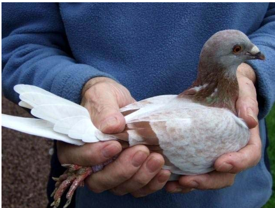
Hoddam Dynamo winner of 1 st open SNFC Falaise 2009