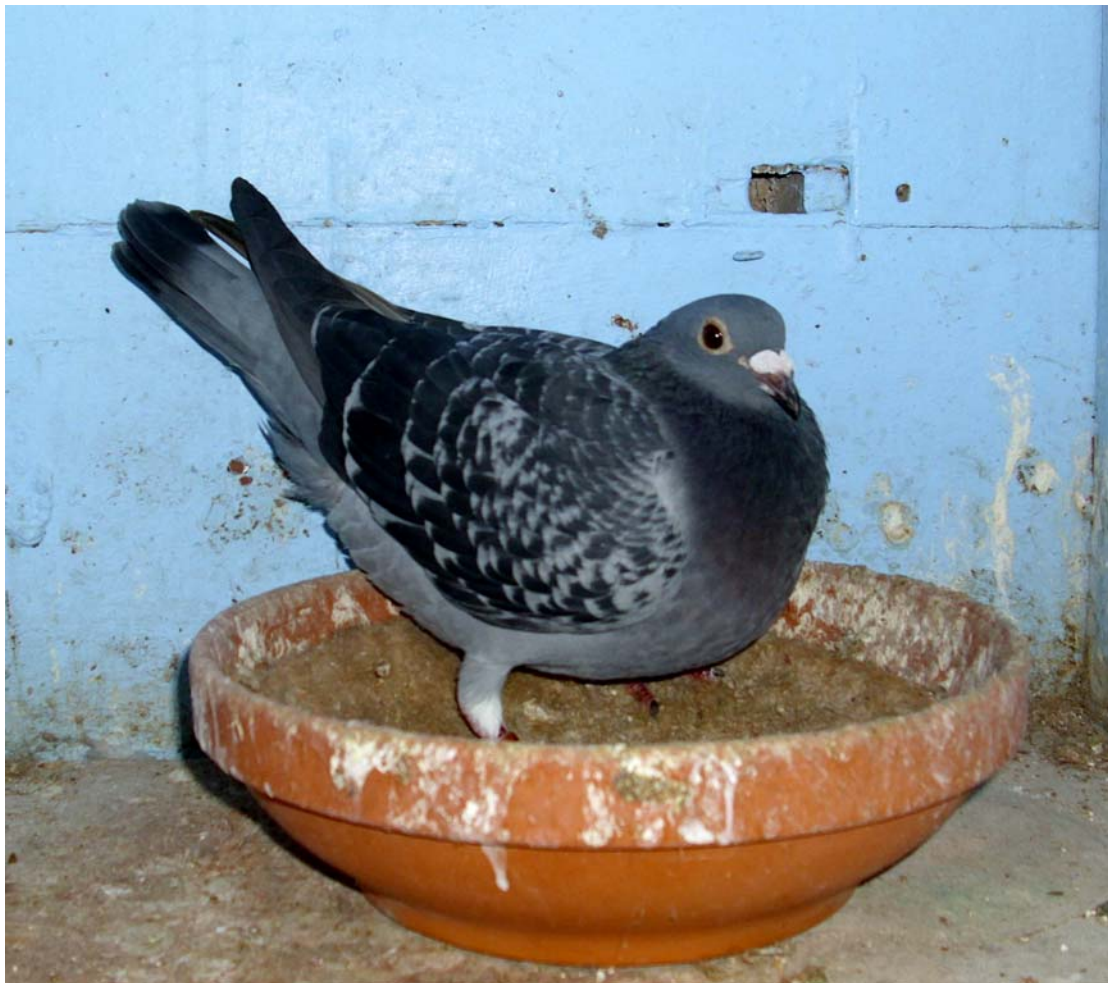
Jenna's Girl winner of 2 nd section E 39 th open SNFC Falaise 2009