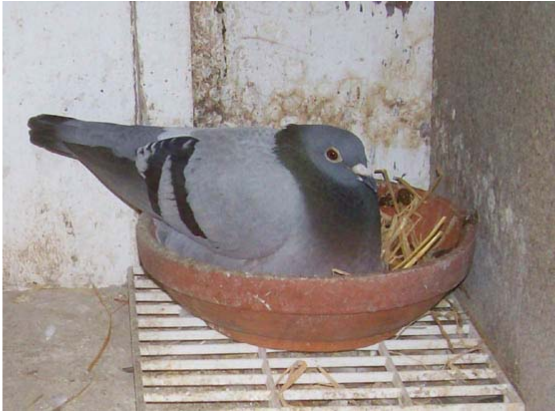
1 st section D 21 st open Falaise winner on her nest