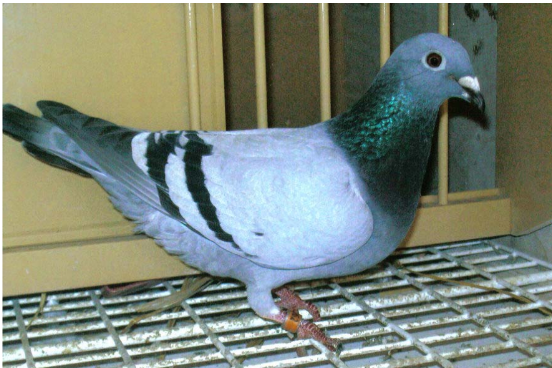
Our Lass winner of 1 st section F 87 th open SNFC Falaise

Our Lass flew most of the young bird programme that year where in her last 2 races she won 1 st club 5 th federation Otterburn 93 miles; and 1 st club 1 st federation Catterick 147 miles. As a yearling she won she started of racing as a widowhood hen but having lost her mate she ended up flying spare. She was entered into the Ripon comeback race flying spare a distance of 165 miles winning once again 1 st club 1 st federation. From there she went to Eastbourne inland national 405 miles sent pairing up to a new mate and was timed on the night 2 nd bird to the loft but not making the result. She was then sent to Falaise sitting 9 days on eggs; this being her first eggs since March and she had also cast 2 flights in each wing and was timed to win 2 nd section F 72 nd open after sitting out for 30 minutes. It never made any difference to her section position but lost out on about 20 open positions.