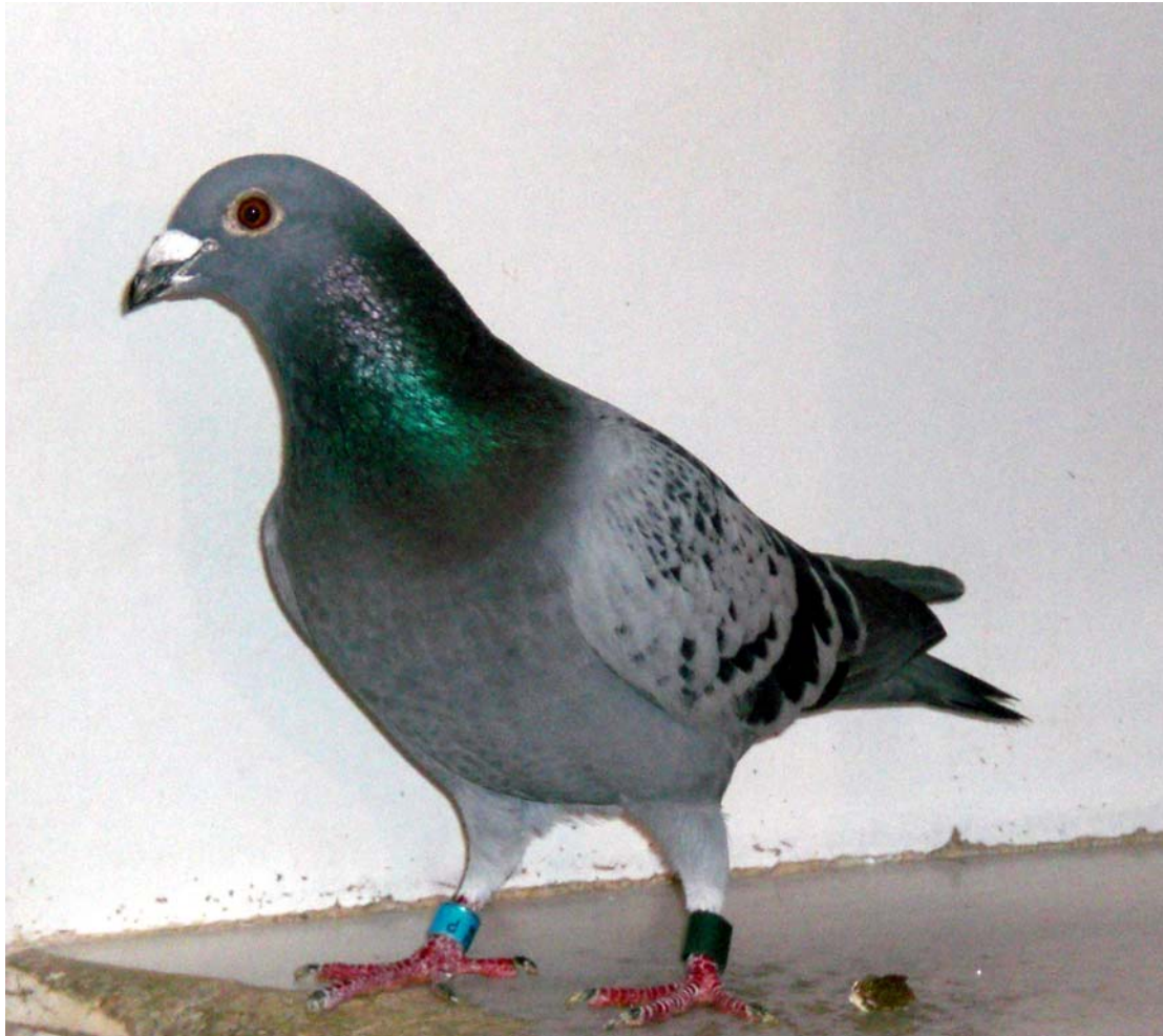
Young Reekie winner of 1 st open SNFC Ypres 2009