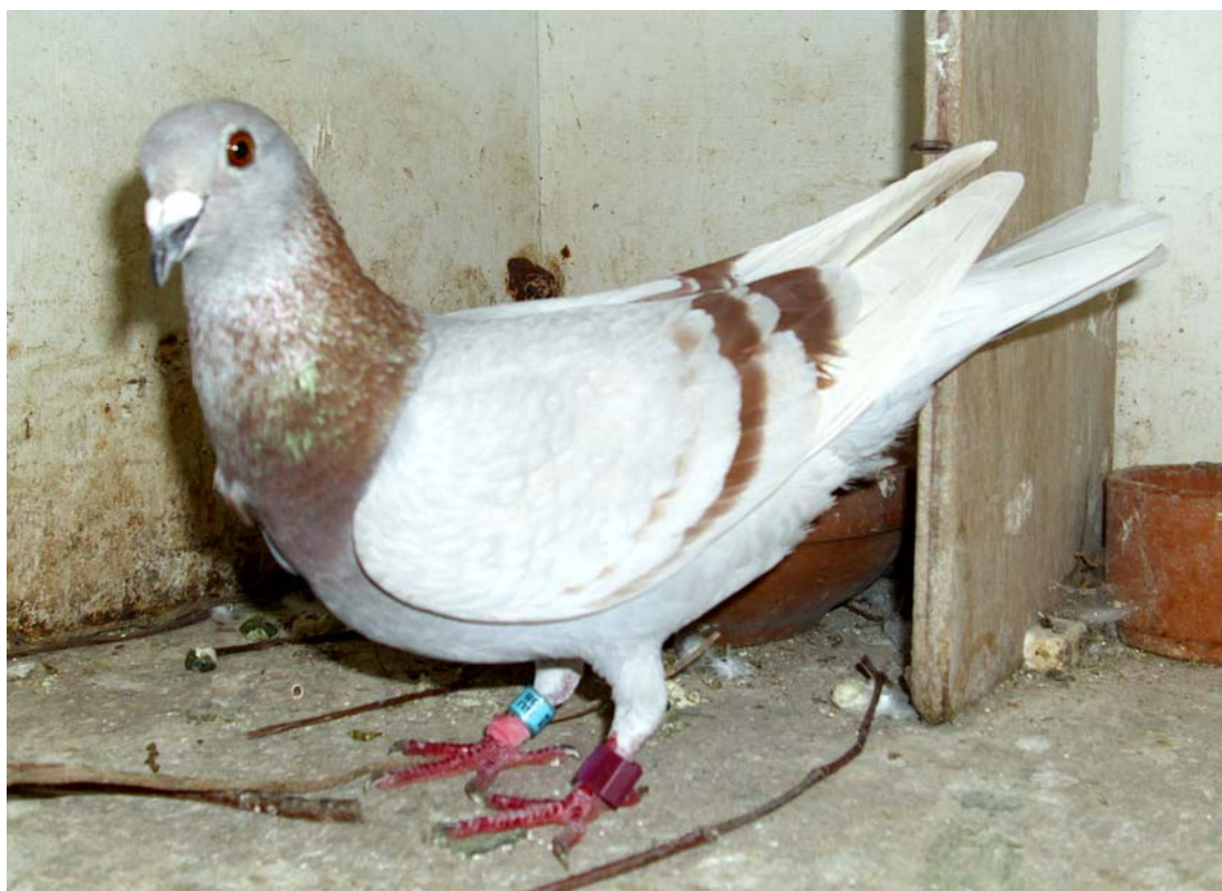
Billy Bilsland 1 st section E 1 st west region 3 rd open Ypres winner

4 days before basketting. No stone was left unturned to get the best out of his birds and success inventively followed.