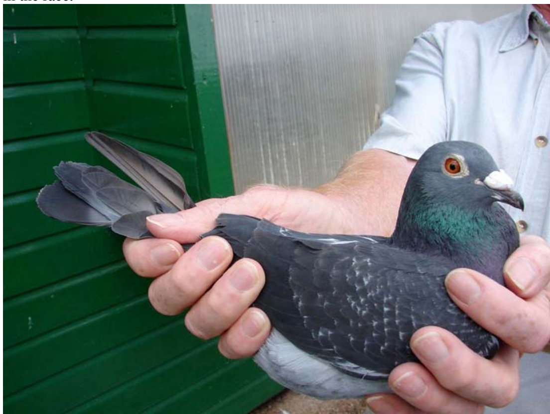
Brian Kinnear's 4 th open SNFC Ypres winning cock