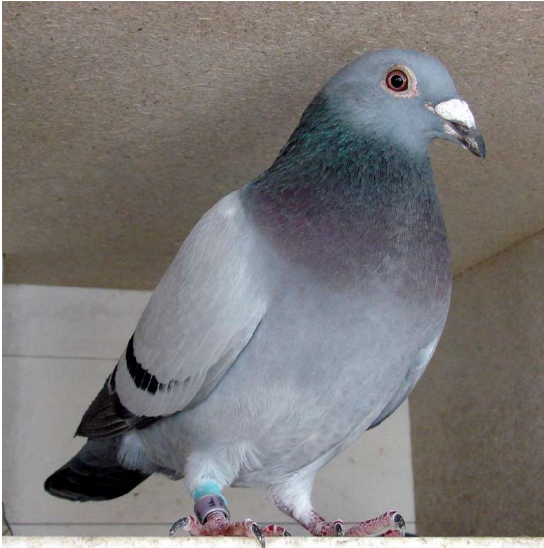
The Turpie & McCord 3 rd section C 9 th open Ypres winner