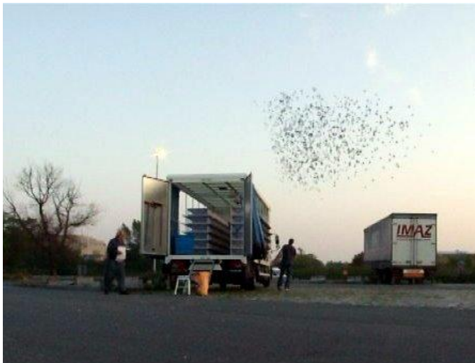
On their way - The Bordeaux Liberation

With a touch of East in the wind one may expect the winning bird to be timed in the West of the country but to be timed as far up as Western-super-Mare in Section C certainly surprised me as top flyer Phil Newton flying 459 miles clocked his two year old hen " Springfield Tornado " at 17:08 to record a velocity of 1209 to win 1 st Section C and 1 st Open National BBC Bordeaux for 2011 . This hen has flown five channel this season the last being the CSCFC Tarbes race where she took a week to return. However Phil got her back down on eggs and she was sent sitting 14 days. She is full of winning bloodlines her Sire is a son of his good hen " Springfield Harrier " who won 1 st Section, 1 st Open CSCFC Bergerac and her Dam is a daughter of NFC Certificate of Merit winner " Springfield Blackbird " his best ever distance pigeon when paired to " Springfield B52 " a winner of 1 st Section 1 st Open CSCFC Cholet. Phil believes in pairing the best to best irrespective of strain creating his own strain of Van Newtons which have won at the top level for many years. The birds are fed on Willsbridge widowhood mix supplemented with farm beans, peas and barley and a few peanuts. He would like to thank also those associated with the BBC for supplying this marvelous competition.