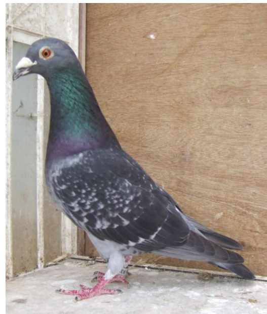
"Reliable" – 3 rd Section B and 18 th Open