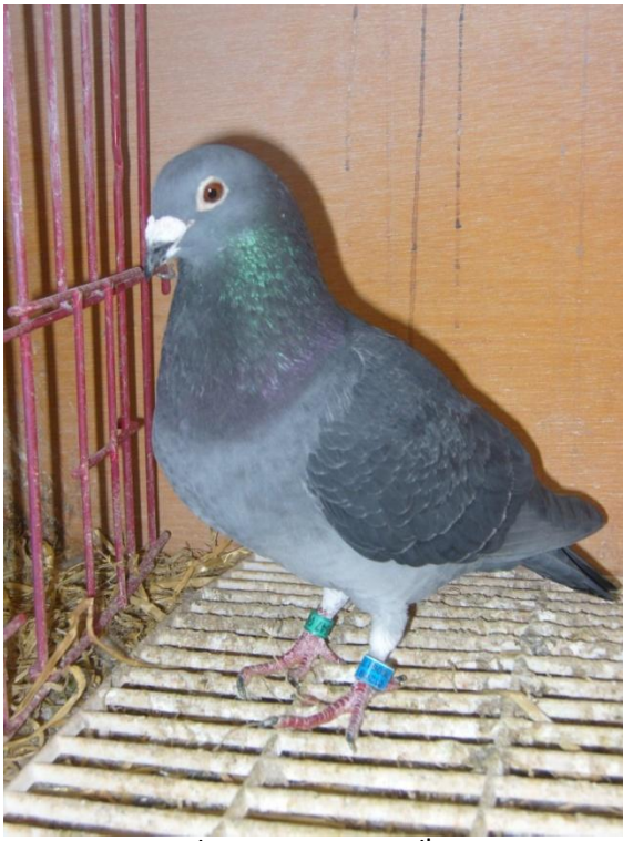
1 st Section C and 7 th Open

In 1 st Section C and 7 th Open was Crowley and Green of Compton Bassett who's team of pigeons are on top form in Classic and National racing of late. Having topped or been second section with their sprint team in the recent NFC races they continued their winning ways with the BBC.