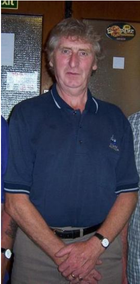
Wyatt & Gray 13 th Open