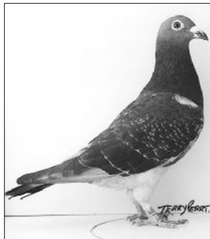
Sire of Turban, 2nd G/Nat Pau, and Engage, 11th G/Nat Pau etc., three times in first 100 and winner of Diploma of Merit. Grandsire of Bilbo, 9th G/Nat Pau, grandsire of Espada, 2nd G/Nat San Sebastian 2001.

Marseilles, gdam of Darsi, 2nd Sect, 70th G/Nat Pau, of Engage, 3rd Sect, 73rd G/Nat Pau 2000.