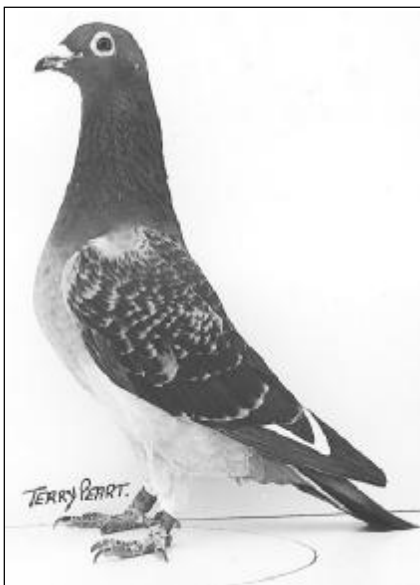
Belg 86-4025282. Dam of Turban, 2nd G/Nat Pau.

336th G/Nat Pau. Gsire Kaiser, Ref O, gdam dtr Favori, Ref L. Dam dtr Unsaid, dam of 21st Sect, 336th G/Nat Pau, gsire Unsaid, sire of Vend '93, 1st G/Nat Pau, sire of Acari, 1st Nat Marseilles '99, gdam dtr Passion, Ref O.