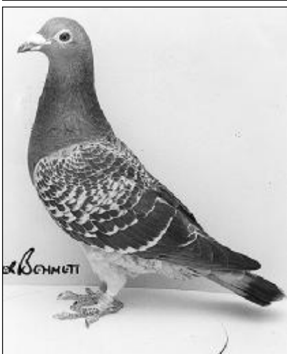
Dam of Certain, 1st Nat Marseilles 2000, g-ggrandam of Vend, 1st G/Nat Pau.