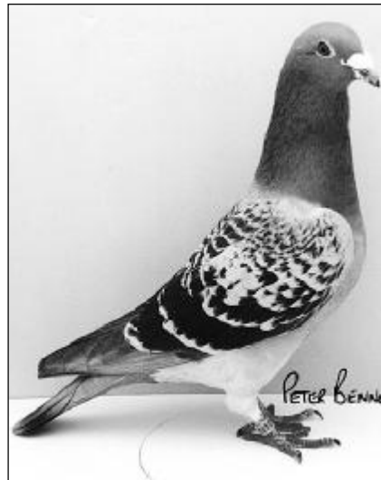
Winner of 5th Sect, 30th G/Nat Pau, 1st Sect, 20th Nat Saintes, 5th Chartres, 5th Orléans.