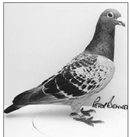
Winner of 1st Nat Palamos, grandson of Natrix.