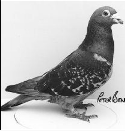
Son of Natrix. Sire of Bassi, 1st Nat Marseilles 1998, 1st Int LD Marseilles 1998, 3rd Nat Maseilles 1999 and 2000. Sire of York, 3rd Nat Marseilles 1998, 7th Nat Marseilles 1999.

Natrix, gdam of Engrain, 1st Sect H, 65th G/Nat San Sebastian 5,564 birds 2001 662 miles. Natrix, Ref J.