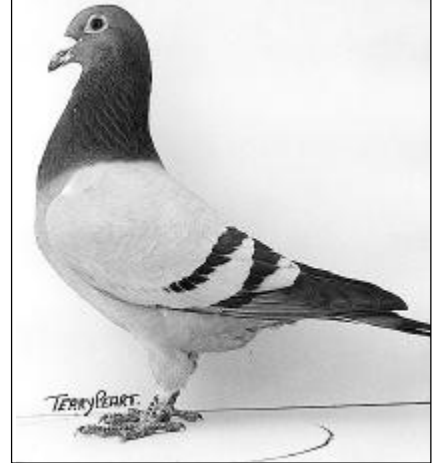
Grandson of Napoleon and Scout, 1st Int San Sebastian 1970. Grandsire of Zestful, 3rd Nat Palamos 1998, grandsire of Espada, 2nd G/Nat San Sebastian 2001, grandsire of Engain, 1st Sect, 65th G/Nat San Sebastian.

Dam 92386 dtr Bear, dam of Cabana, 2nd Sect, 24th G/Nat Pau '98. Gsire Bear, Ref M. Gdam dtr Mirage, son of Napoleon. Sire of Occult, 34th Nat Pau, 2nd Nat Pau, 5th Nat Pau, 30th Nat Dax, 8th Nat Pau.