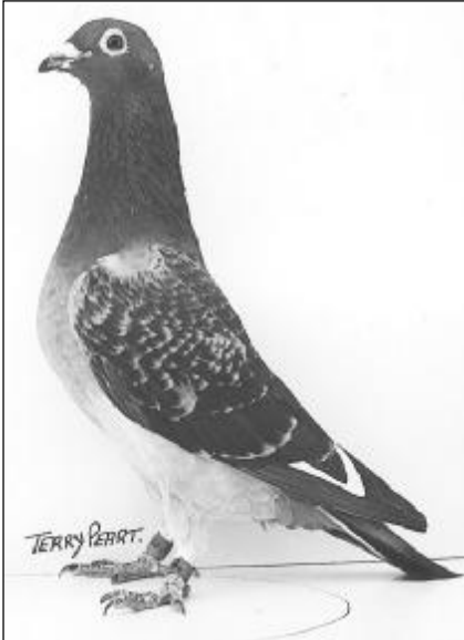
Belg 86-4025282. Dam of Turban, 2nd G/Nat Pau.

Lot 10. 03-23101, Blue Hen. Sire 98442, Elkon; gsire Red Perpignan, Ref F; gdam daughter Pacer, dam of Cubit, 1st G/Nat Saintes 1996. Dam dtr Turban; gsire Turban, Ref H; gdam dtr Lama, dam of Yodle, 2nd Nat Barcelona, 9th Nat Barcelona, dam of Yetis, 3rd Nat Barcelona, dam of Binder, 14th Nat Perpignan, 13th Sect, 263rd Nat Nantes 1998, gdam of Century, 7th Nat Barcelona 2000.