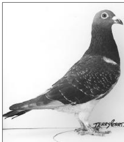
Sire of Turban, 2nd G/Nat Pau, and Engage, 11th G/Nat Pau etc., three times in first 100 and winner of Diploma of Merit. Grandsire of Bilbo, 9th G/Nat Pau, grandsire of Espada, 2nd G/Nat San Sebastian 2001.