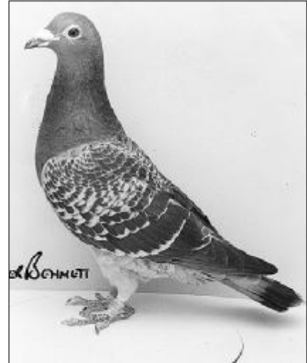
Dam of Certain, 1st Nat Marseilles 2000, g-grandam of Vend, 1st G/Nat Pau.