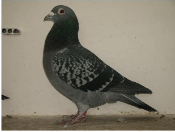
"Oliver" – 1 st Section G 17 th Open