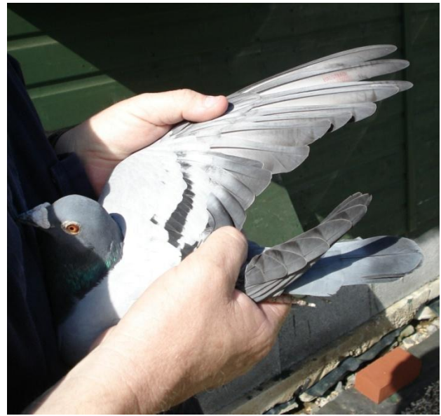
The Wing of "Maurice" 1 st Open BBC Palamos