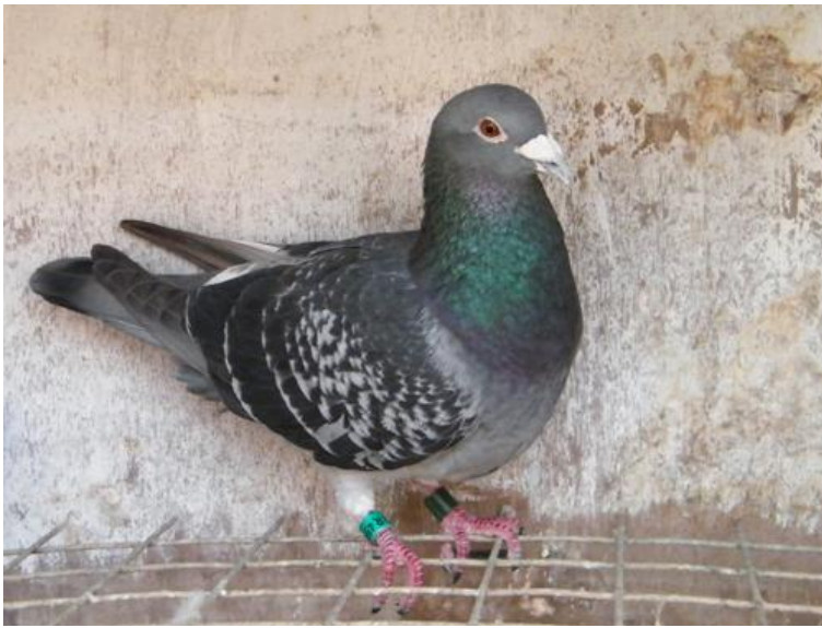
“Deorwine” – 1 st Section D 4 th Open Palamos

At Romford we have TEAM RML clocking a dark chequer cock at 17:44:36 to record a velocity of 751 and take 1 st Section D and 4 th Open . Who you may say - TEAM RML, well the concept is simple, one loft and one team of pigeons. In this case all the pigeons come from one loft and in this particular instance it is only anticipated that they will race for a couple of years or so. They could of course be drawn from several and in a long term plan they could be bred and acquired progressively by the Team. They will be prepared and trained by one individual. The group however will participate in all discussions and decisions as things progress. Public information will be maintained in a detailed way with training and race reports carried on a web site while additional information and discussion between group members taking place through Newsletters.