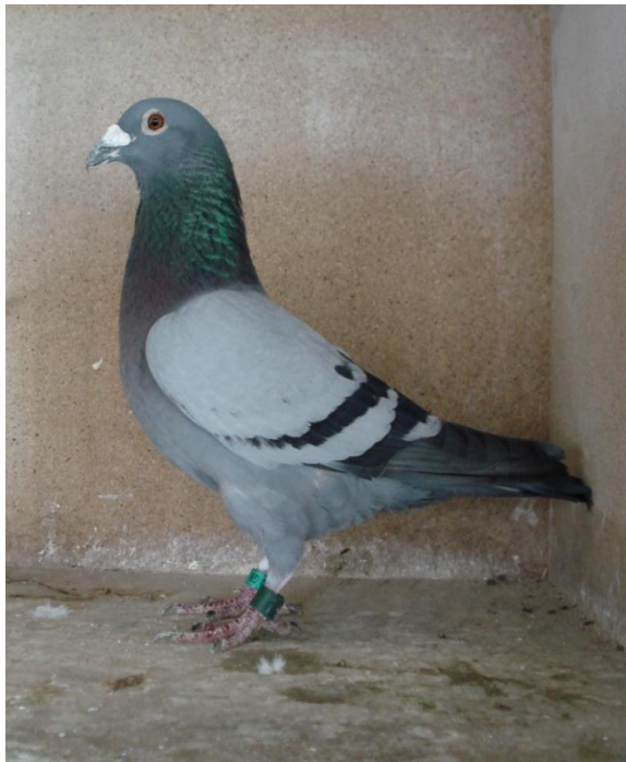
"Maurice" – 1 st Open BBC Palamos