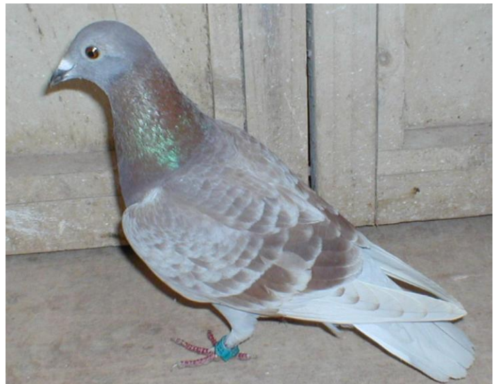
3 rd Section E 17 th Open

GB10B21599 (4 th Gold Ring) a Red Cheq hen called " Red Rosie " flies the 346 miles to Northwich where she is timed in by Mr & Mrs Howman at 14:41 to win 3rd Section E and 17 th Open with a velocity of 1462 . From the photograph you can see that she's a small medium hen with an apple body and rich coloured eye she is bred down from Black Gold (Camphius) and Bubble (Silvre Toy) on the sires side these being the winners of the South West One Loft Race and the Europa One Loft Race 2006 respectively the dam is from Stock purchased at the bereavment sale of Bob Lewis a good friend and great distance flyer from his Kirkpatrick Stock. This hen was sent sitting 12 days and has previously come to win at club level beaten by loft mates.