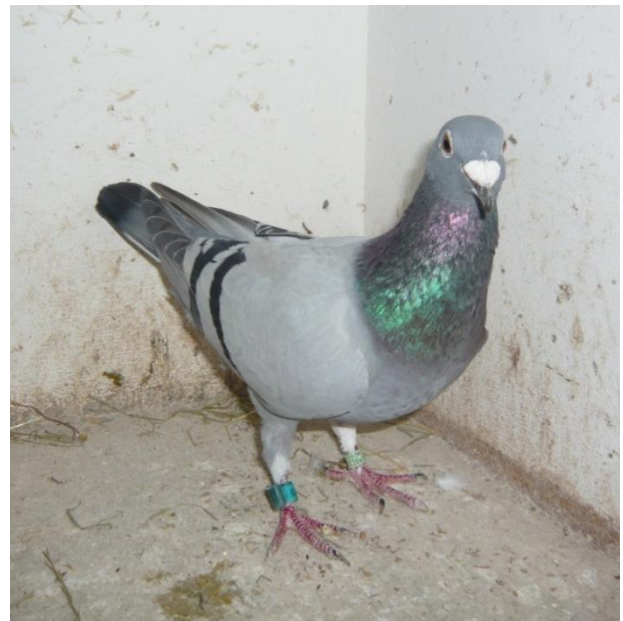
1 st Section E and 14 th Open