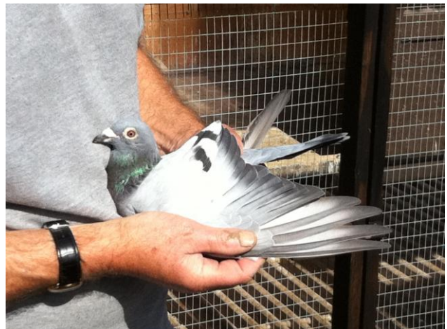
1 st Section C 8 th Open Old Hens