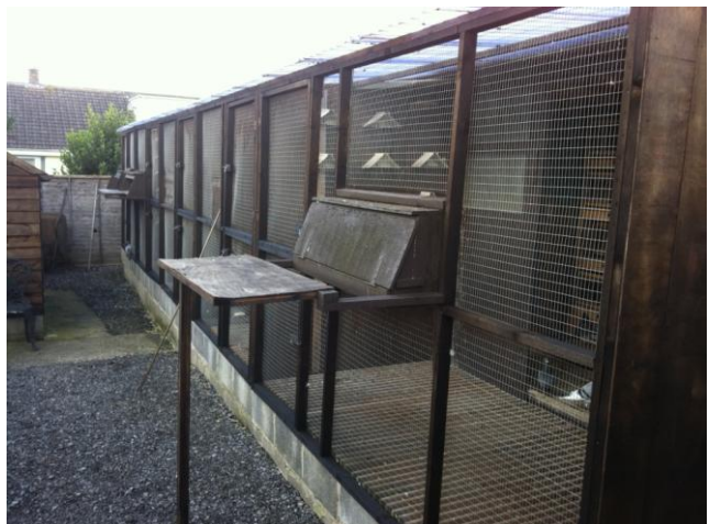
The racing loft of J & D Staddon