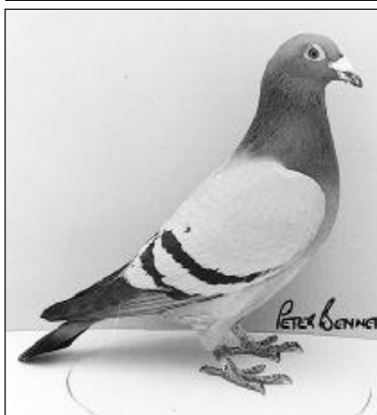
9th Chartres, 462 birds, 1991; 1st Pau G/Nat, 5,427 birds, 1993; 1st Pau Sect, 278 birds, 1993. Grandsire of Davit, 9th G/Nat Pau 2000, grandsire of Century, 7th Nat Barcelona 2000, brother to Acari, 1st Nat Marseilles 1999; 5th Sect, 64th G/Nat Pau 1998 etc.

dtr Passion Ref O, nest sister to dam of Vend 1st G/Nat Pau and of Acari 1st Nat Marseilles. Dam of Bassi 1st Nat Marseilles, 1st Int LD Marseilles, 3rd Nat Marseilles, 6th Nat Marseilles; g/dam of Darsi 2nd Sect, 70th G/Nat Pau, of Engage 3rd Sect, 73rd G/Nat Pau '00. Dam 20380 dtr Vend; g/sire Vend Ref E; g/dam dtr Crack Perpignan Ref G.