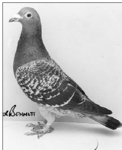
Dam of Certain, 1st Nat Marseilles 2000, g-grandam of Vend, 1st G/Nat Pau.

g/dam dtr Yealdon, dam of Bilbo 9th Sect, 295th Nat Saintes; 3rd Sect, 9th G/Nat Pau, 11th Falaise; 9th Sect, 145th G/Nat Pau; 9th Sect, 407th Nat Saintes; 6th Sect, 142nd G/Nat Pau. Dam 98436, dtr Red Perpignan; g/sire Red Perpignan Ref F; g/dam dtr Legacy, dam of Billie 6th Sect, 16th G/Nat Pau '97; dam of Alcove 4th Sect, 14th G/Nat Pau '97 and 14th Sect 199th G/Nat Pau '98. Legacy Ref K.