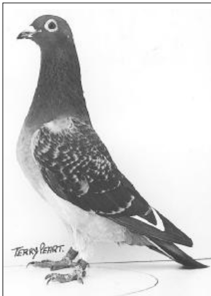
Belg 86-4025282. Dam of Turban, 2nd G/Nat Pau.

Barcelona 776 miles, 27th Nat Perpignan, 50th Nat Pau, 13th Nat Marseilles, 6th Nat Perpignan, 28th Nat Barcelona, 29th Nat Barcelona, 16th Nat Perpignan; g/dam dtr Turban Ref H.