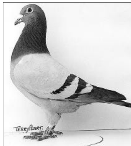
Grandson of Napoleon and Scout, 1st Int San Sebastian 1970. Grandsire of Zestful, 3rd Nat Palamos 1998, grandsire of Espada, 2nd G/Nat San Sebastian 2001, grandsire of Engain, 1st Sect, 65th G/Nat San Sebastian.