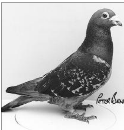
Son of Natrix. Sire of Bassi, 1st Nat Marseilles 1998, 1st Int LD Marseilles 1998, 3rd Nat Maseilles 1999 and 2000. Sire of York, 3rd Nat Marseilles 1998, 7th Nat Marseilles 1999.