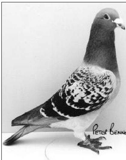
Winner of 5th Sect, 30th G/Nat Pau, 1st Sect, 20th Nat Saintes, 5th Chartres, 5th Orléans.

Nantes '98. G/dam of Century, 7th Nat Barcelona '00. Dam 98450, dtr Red Perpignan; g/sire Red Perpignan, Ref F; g/dam dtr Legacy, dam of Billie, 6th Sect, 16th G/Nat Pau '97. Dam of Alcove, 4th Sect, 14th G/Nat Pau '97 and 14th Sect, 199th G/Nat Pau '98.