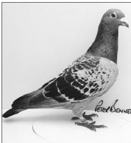
Winner of 1st Nat Palamos, grandson of Matrix.