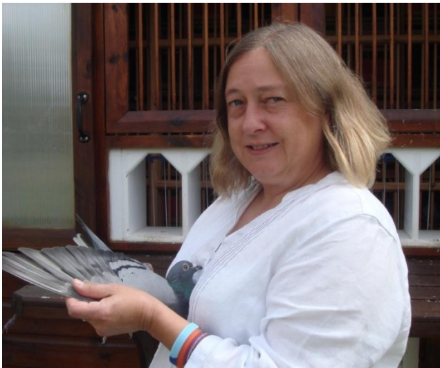
The Special Hen