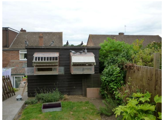
One of the Carrick Lofts