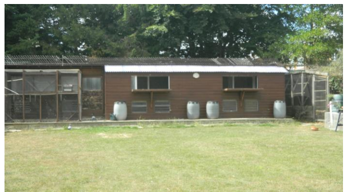
The Hobbs Partnership Lofts