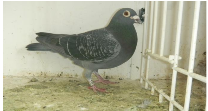
"Leather" 2 nd Open BBC Bordeaux