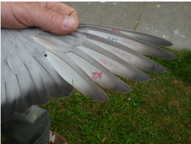
The Wing of “Bordeaux Queen”