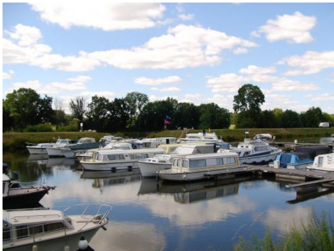
The Harbour at Messac

The second National race of 2011 for the British Barcelona Club was on Saturday the 14 th May when 327 members sent a record entry of 2,594 birds to the lovely small ancient Roman town of Messac which is located on the left bank of the river Vilaine. A strange set up with the town of Guipry located on the opposite bank and the two towns then being connected by a bridge.