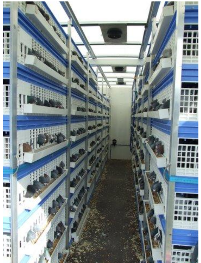
Birds being fed from the troughs

Friday dawned to clear blue skies and no wind, the journey to Messac saw small pockets of mist lying in the valley's, arriving at Messac at 11:30 and all the birds were watered in quick time now the water pump has been fitted. All birds were fed at 16:00 and to see all the heads out in the feeding troughs was very encouraging (see picture)