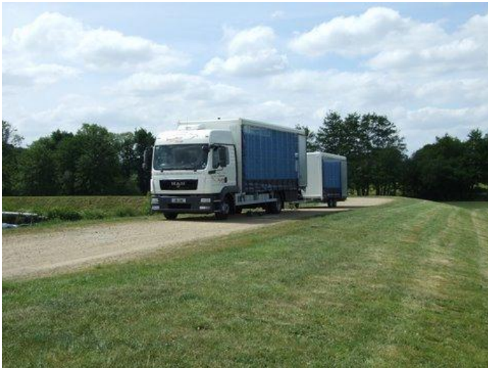
Lorry at the Messac Site

Saturday dawned to clear blue skies and no wind the temperature in the transporters was 14 degrees and the outside temp was climbing all the time and after speaking to our race controller Eric Ilsley the forecast was good all the way back to Britain but the wind was due to increase to a strong NW and heavy showers as the day progressed so I made the decision to liberate the 2,594 birds at 06:30 to give the longest fliers a fighting chance of a day bird. The birds climbed high in the sky before heading off to the north clearing well at the time of liberation the outside temp 17 degrees and no wind at all but the high clouds were coming from the North West.