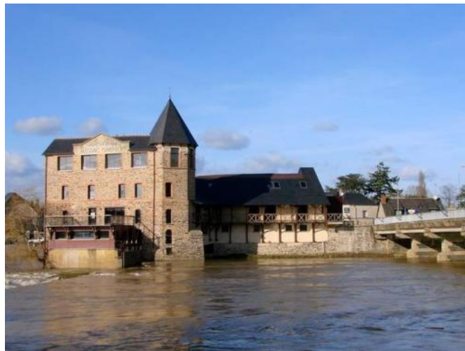
The Mill at Messac

Marking took place on Thursday the 12 th May with two thirds of the birds being marked at Salisbury and the rest at Penkridge and Walkern. At Salisbury everything went as smooth as a baby's bottom with many fanciers commenting on the short wait which can be directly attributed to the army of volunteer helpers who manned the four ETS and the three marking tables for rubbers. Thank you, to you all, you were a credit to the British Barcelona Club and were instrumental in ensuring that the birds were efficiently marked, loaded and safely transported to the point of liberation.