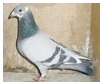
39th Open BICC Pau, 4th bird over 600 miles into England.