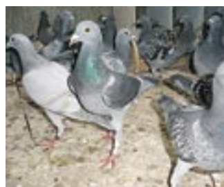
This year's young birds from Dreadlock Lofts.

There is a policy at Dreadlock Lofts not to use any antibiotics at all. "We believe the flier forms an actual dependency as much as the bird, with regular blind treatments using antibiotics. This is where we find Orego-Stim ® Pigeon to be the most reliable product. It keeps our birds free from loose and wet droppings, with remarkable recovery rates after tough races.