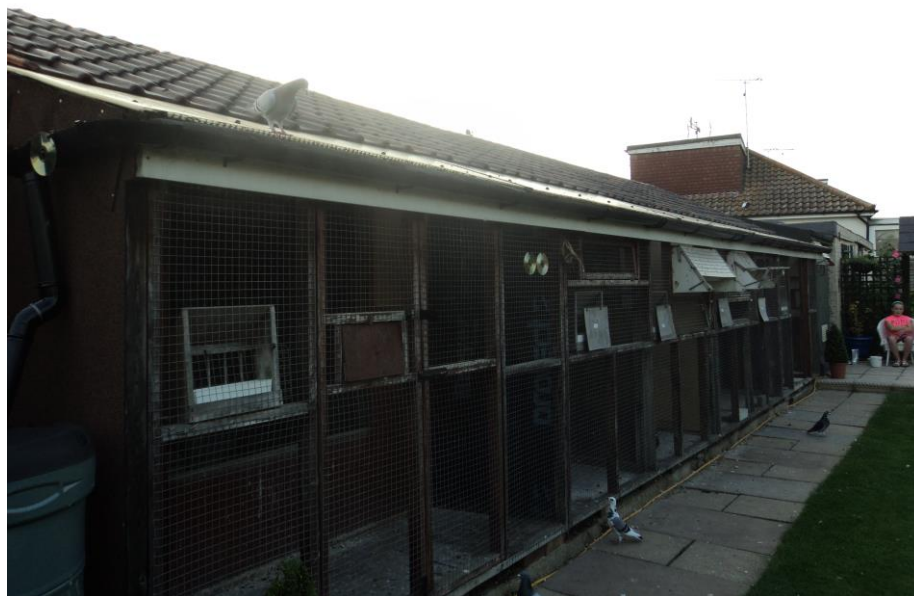
The Pearmain loft