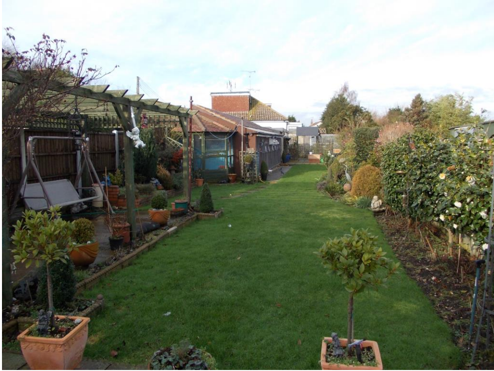
The Pearmain loft