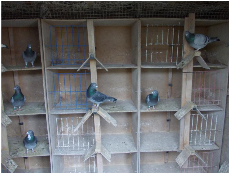
One of the Old bird sections at the Pearmain loft