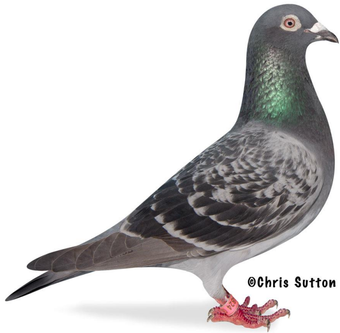
Donegal Girl 1st Open BICC Marseille for Pearmain&son