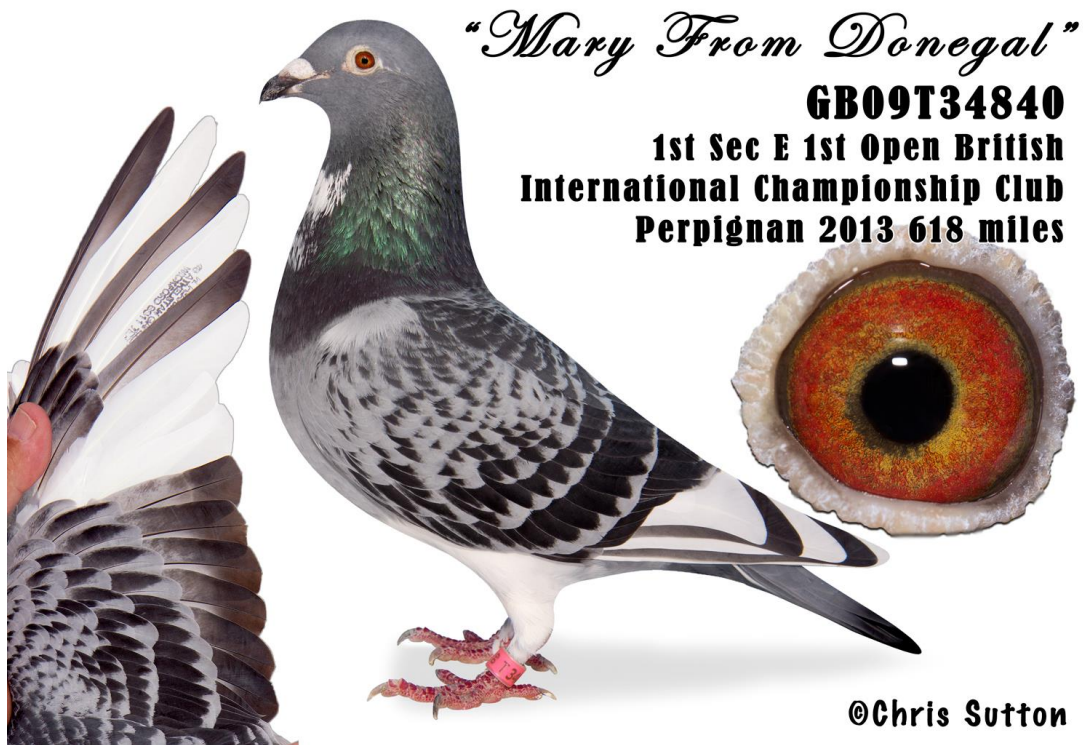
Mary from Donegal. Pearmain & son's Merit Award winner 13th Open Pau 26th Open Agen 34th Open Pau 18th Open