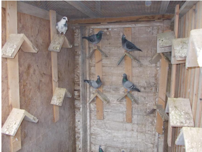
One of the old hens sections at the Pearmain loft