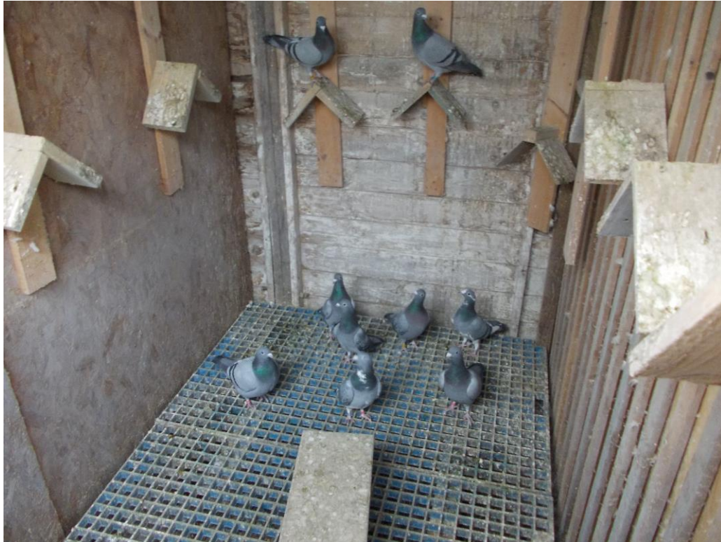
Hens section with plastic grid flooring