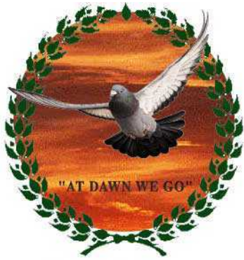
Central Southern Classic Flying Club