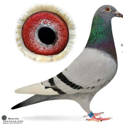
"Antonia" GB 21 H 44069

2nd Section/20th Open Prov. British Barcelona Club Guernsey OBAA National 105 miles 30/08/2024