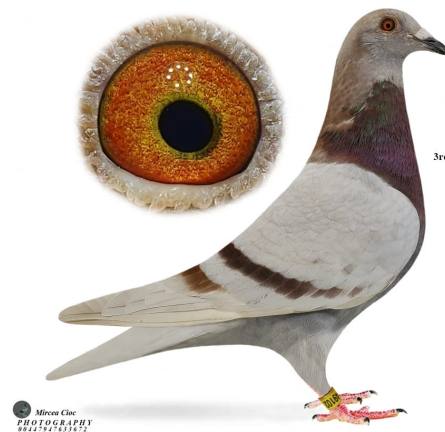
"Arik" GB 24 N 49102

3rd Section/ 11th Open Prov. British Barcelona Club Guernsey YB National 105 miles 30/08/2024