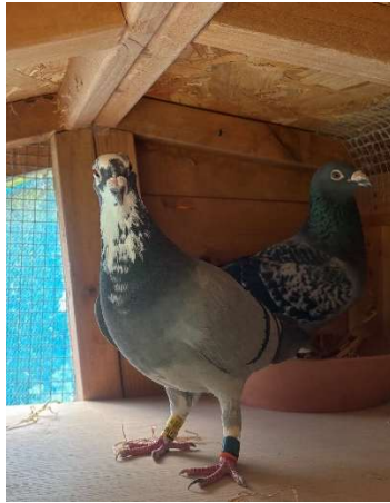
Darren Ede's pied hen

Welsh South Road National against 330 birds. On 16 th May, from Signy-sur-Mer, she was 16 th Welsh Continental Classic Club against 287 birds, 17 th West Section and 619 th Open NFC against 4,708 birds. On 23 rd May, from Nort-sur-Erdre, she was 15 th Welsh South Road National against 285 birds, as well as 42 nd BICC West Section and 53 rd Open against 4,643 birds. Then on 30 th May, again from Nort-sur-Erdre, she won 5 th Welsh Continental Classic Club against 138 birds. Now she adds 1 st Welsh South Road National against 117 birds and, provisionally, 2 nd BICC West Section and 55 th Open against 2,892 birds. The partnership has been the top loft in both the Welsh Continental Classic Club and the Welsh South Road National Club all season.