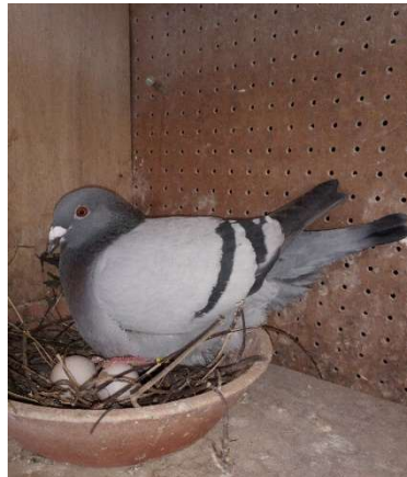
Pete Woods' hen