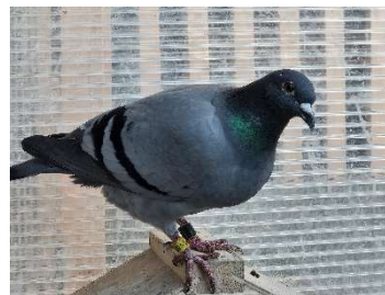
Zsolt Toth's hen